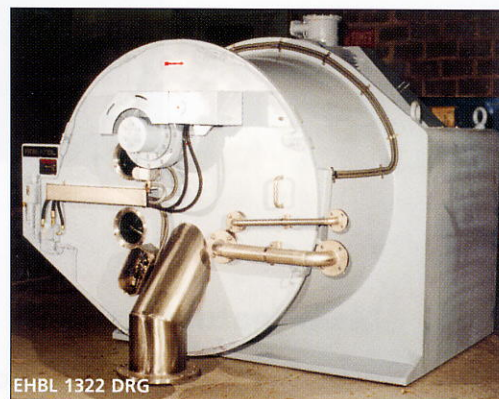
EHL 1322 DRG