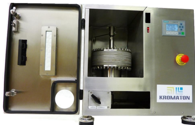
Kromaton FCPC with open door to show rotor compartment