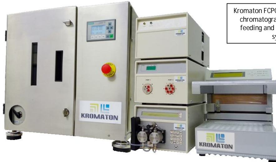
Kromaton FCPC® A 200 Centrifugal chromatograph—with turn-key feeding and sample collection system.

Kromaton offers a complete range of FCPC® stations designed for ease in use. They are adaptable to all lab environments with possibilities to extend the system using different peripherals.