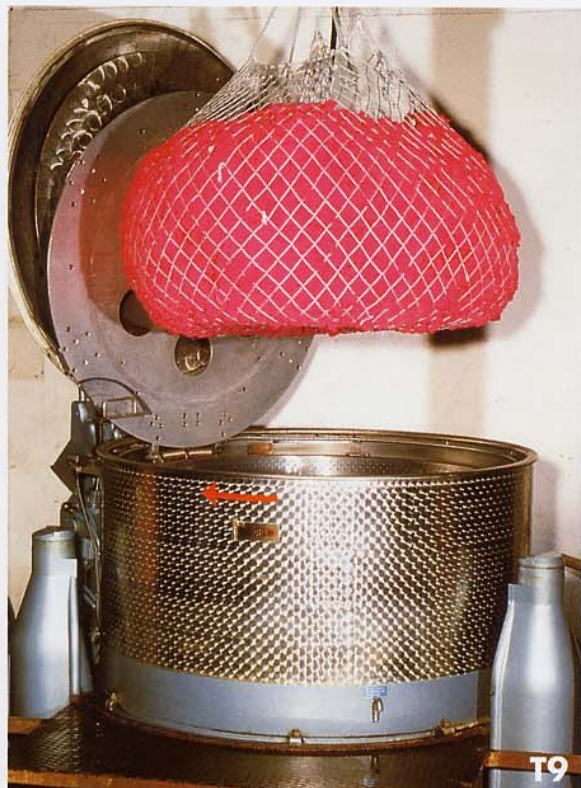
Hydro-extractor with removable net for hanks, pieces and fabrics. Type KFI.