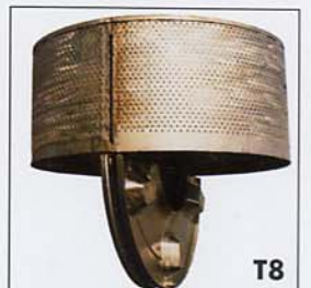
Basket with bottom opening for use in laundry industry. Type KFO and KLU.