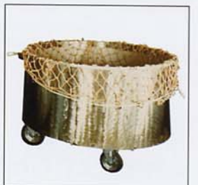
Loading trolley (for Type KFI).