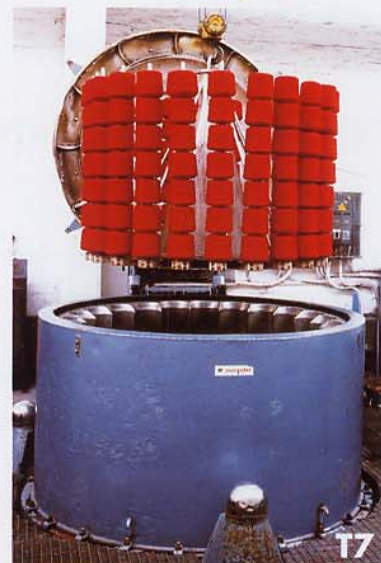
Hydro-extractors with spindle holder for conical / cylindrical bobbins. Type KBOB.