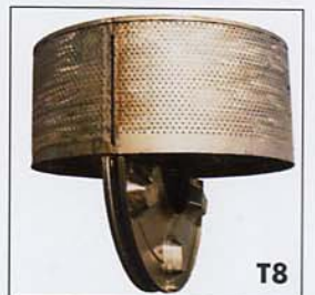
Basket with bottom opening for use in laundry industry. Type KFO and KLU.