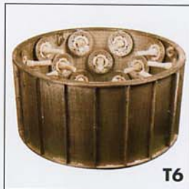
Basket for conical bobbins/packages. Type KBO.