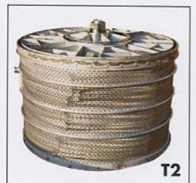
Basket for loose stock fibres to be used in conjunction with an autoclave (kier).