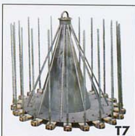
Spindle holder being loaded into specially formed basket for conical/cylindrical bobbins. Type KBOB.