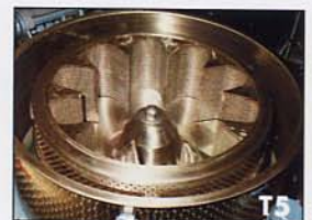
Cell basket for tops, cylindrical bobbins. Type KFUS.