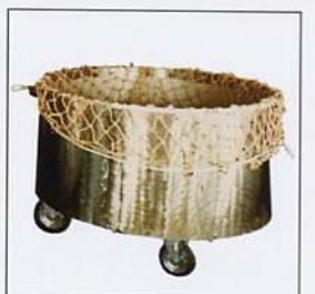
Loading trolley (for Type KFI).