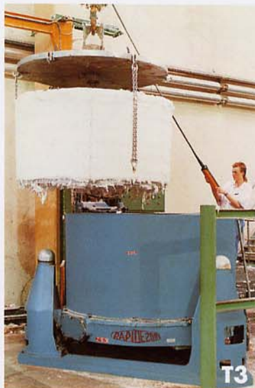
Hydro-extractor with plate and chains for de-watering cakes following dyeing in an autoclave. Type KGA.