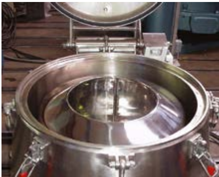
Bowl DRC 60 Vx