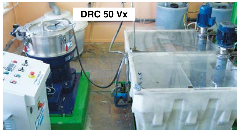
DRC 50 Vx