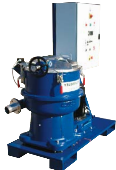
DRC 50 Vx 1S man