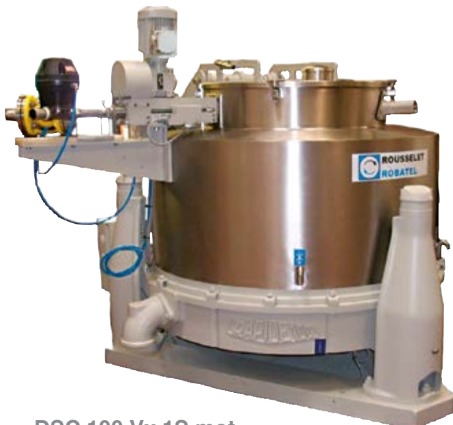
DSC 100 Vx 1S mot in Metal working industry

RR can customize the centrifuge to meet the clients technical and performance characteristics: