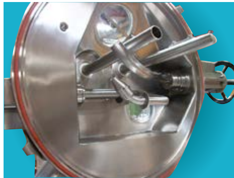
Lid inside DRC 50 Vx 2S man