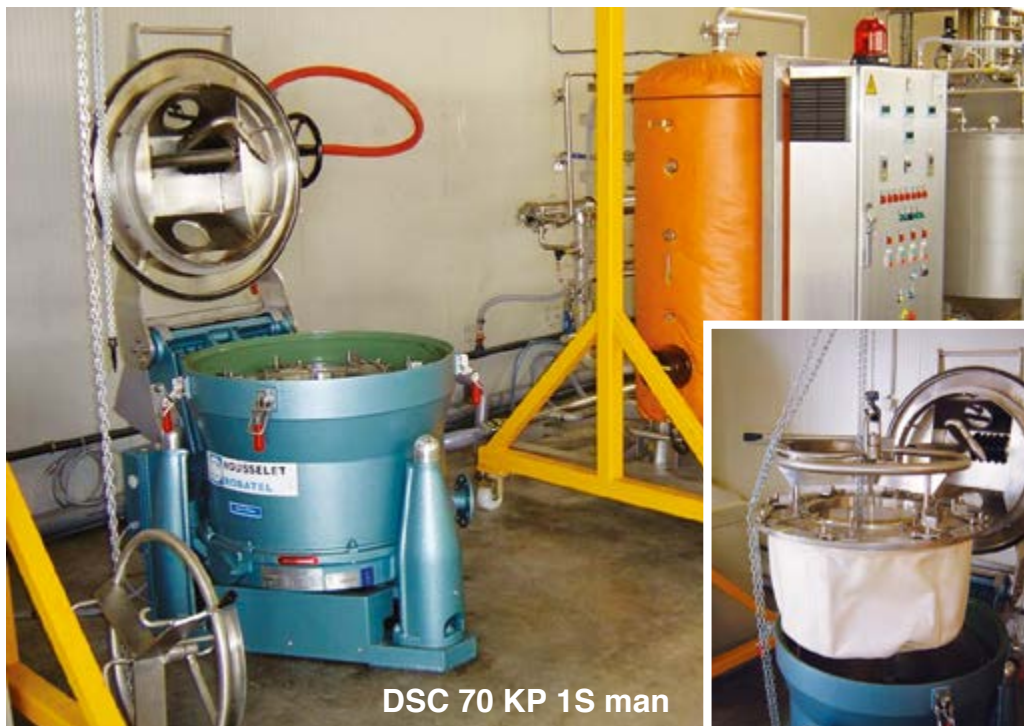
DSC 70 KP 1S man

The removable cage can be wrapped with a textile bag to prevent sediment loss, in case of cake collapse (types DRC-Vx KP / DSC-KP)