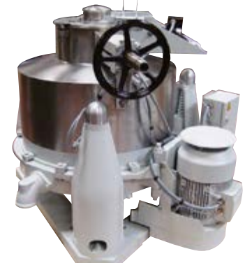
DSC 70 1S man