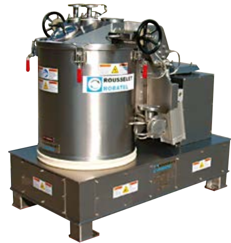
DRC 50 Vx 2S man