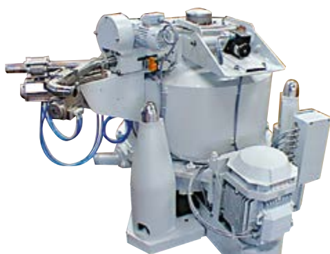
DSC 70 1S mot