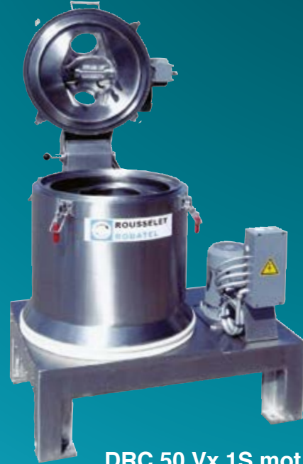
DRC 50 Vx 1S mot for Food industry purpose

ROUSSELET ROBATEL offer a wide range of semi-continuous centrifugal decanters used for the separation of liquid and solid phases from a solution containing more or less fine solid particles