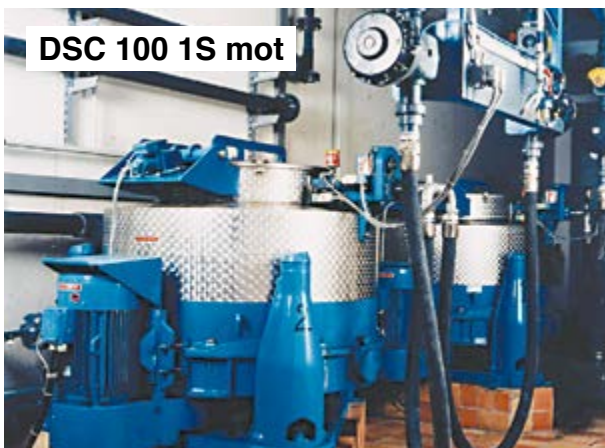
DSC 100 1S mot