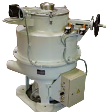
DRA 50 1S man