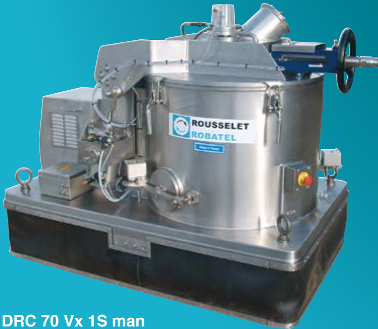
DRC 70 Vx 1S man for Cosmetics application